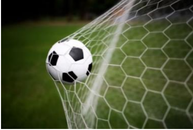
FC Puma Soccer

Academy is committed to the development of youth players, ensuring them a solid technical foundation and understanding of the game in a non-pressured, fun learning environment. Please join us this summer for a unique learning experience. It promises to be an enjoyable and rewarding summer camp experience for everyone involved.